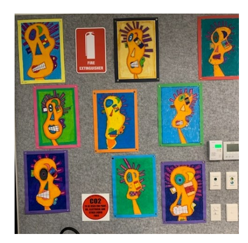
1/2 Blue Maths